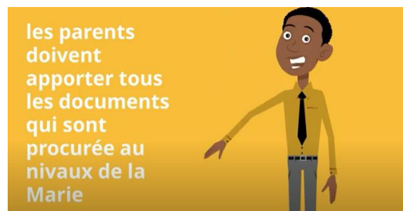
Animation illustrating the necessary steps needed to declare a child's birth

A rural birth registration event was held at the end of 2019, with forms for 200 people being submitted. The early months of 2020 saw these documents going through the correct procedures for sign off at the level of the tribunal office in Tambacounda and at the Town Hall in Dialocoto. The completed birth certificates were then distributed.