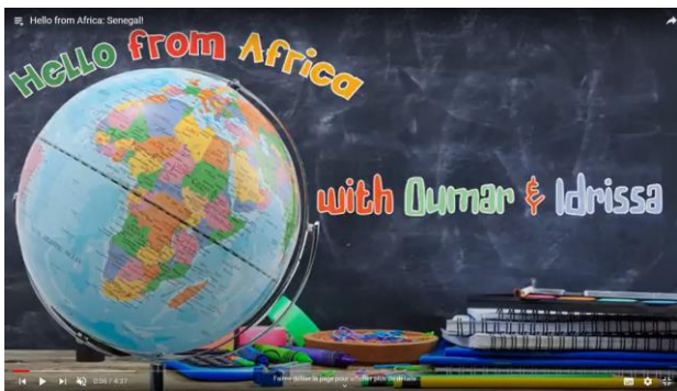
The "Hello from Africa" series

We had planned to accompany our work in Senegal with global education sessions including live African dance lessons within primary schools in Wales. Due to COVID-19 however, we had to adapt our plans and rather than delivering educational sessions within schools we worked with a local film producer to develop a series of five videos providing fun facts about five different African countries followed by a follow-along African dance class with Idrissa Camara. We have made these videos freely available on YouTube and shared them with local schools and other groups we thought might be interested. We have received positive feedback from teachers who have agreed to include these films as part of their home-education resources packages.