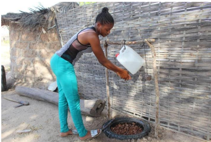
A young women using a household tippy tap.

Alongside our messaging campaign, we also looked at how to enable better hand hygiene within rural villages, where handwashing with soap is rarely practiced. This was against the background of WHO advice which was stressing that handwashing with soap is the most cost-effective way of reducing the transmission of the COVID-19 virus. We trained up a small team of local youth to be able to instal tippy taps- a simple handwashing device that works by using the foot as a lever to tip water out from a container allowing hands to be washed without touching any of the equipment with your hands. These tippy-taps were initially installed within each household in a single village. Towards the end of the year we secured further funding to replicate this work in a further seven villages with approx.. 3,500 inhabitants. We also planned to support a local women’s group to increase their production and sales of a local soap block.