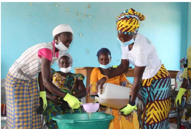
A women’s group producing solid soaps for sale